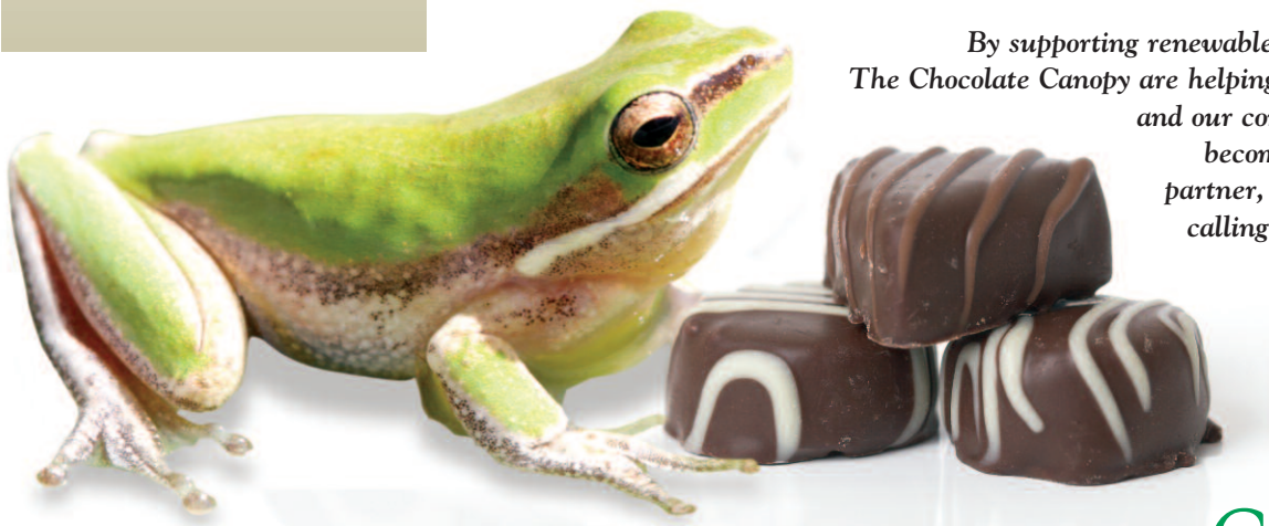
—Chris Paris Co-Owner, Chocolate Canopy

And to learn more about The Chocolate Canopy, visit www.chocolatecanopy.com .